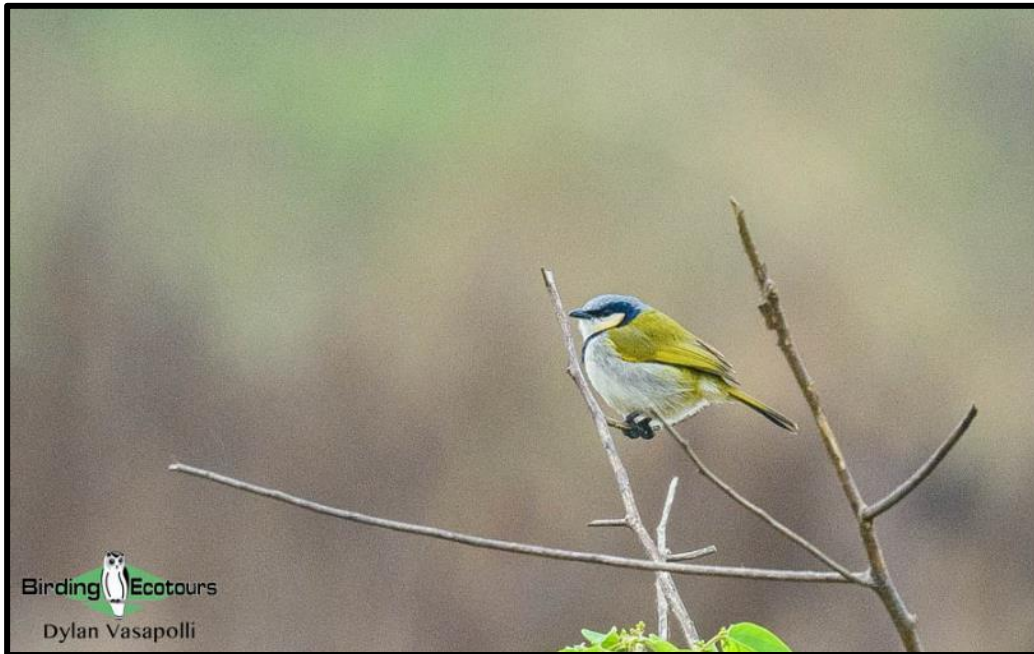
The odd-looking Black-collared Bulbul is uncommon throughout its relatively small range.

Most of our targets will be sought in the forests and dense thickets, for example, Western Bronze-naped Pigeon , White-spotted Flufftail , Narina Trogon , Blue Malkoha , Olive Long-tailed Cuckoo , Purple-throated Cuckooshrike , Blue-breasted Kingfisher , Least and Pallid Honeyguides , the rare and extremely shy Spotted Thrush-Babbler (easy to hear, challenging to see), Fraser’s Rufous Thrush , Grey-winged Robin-Chat , Honeyguide Greenbul , and Splendid Starling . Forest streams in this area always require careful scanning for Shining-blue Kingfisher and the scarce White-bellied Kingfisher . Spot-breasted Ibis can, with luck, also be seen in this area, particularly at dusk when vocal birds return to roost. In addition to all these new species, Nyachisala also serves as a backup for some of our targets, like Bamboo Warbler and Laura’s Woodland Warbler , should we have missed them earlier in the trip.