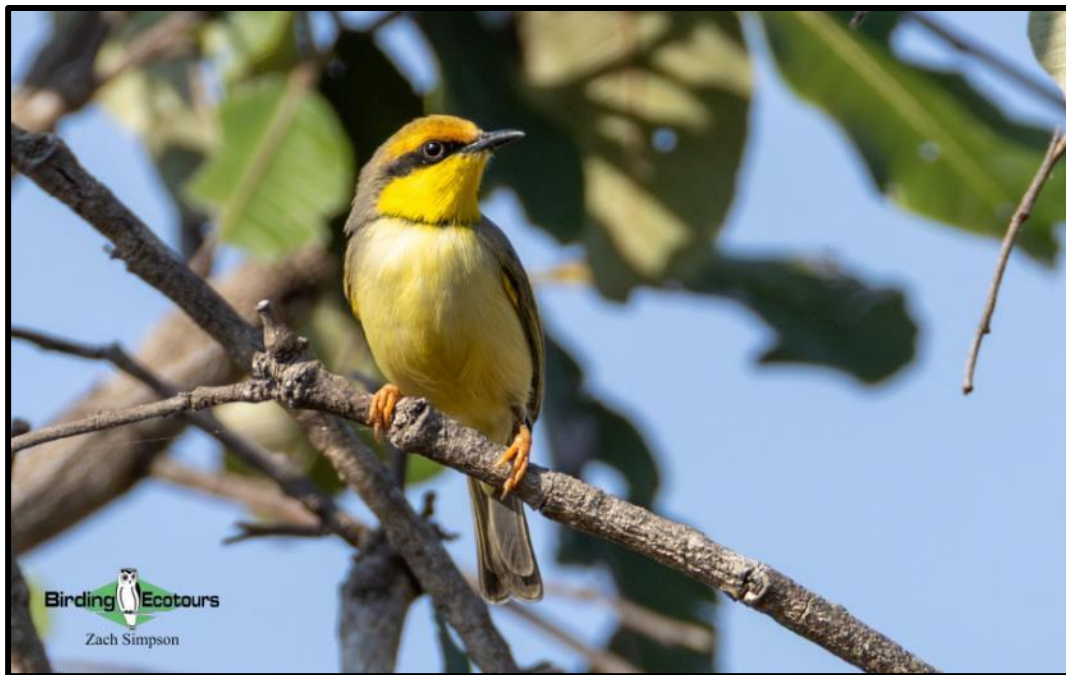
Black-necked Eremomela is another of the sought-after miombo targets on this tour.

We will conclude the tour with a visit to the world-famous Victoria Falls and an afternoon boat cruise on the Zambezi River , where we have a chance to see African Skimmer , Rock Pratincole , and even African Finfoot .