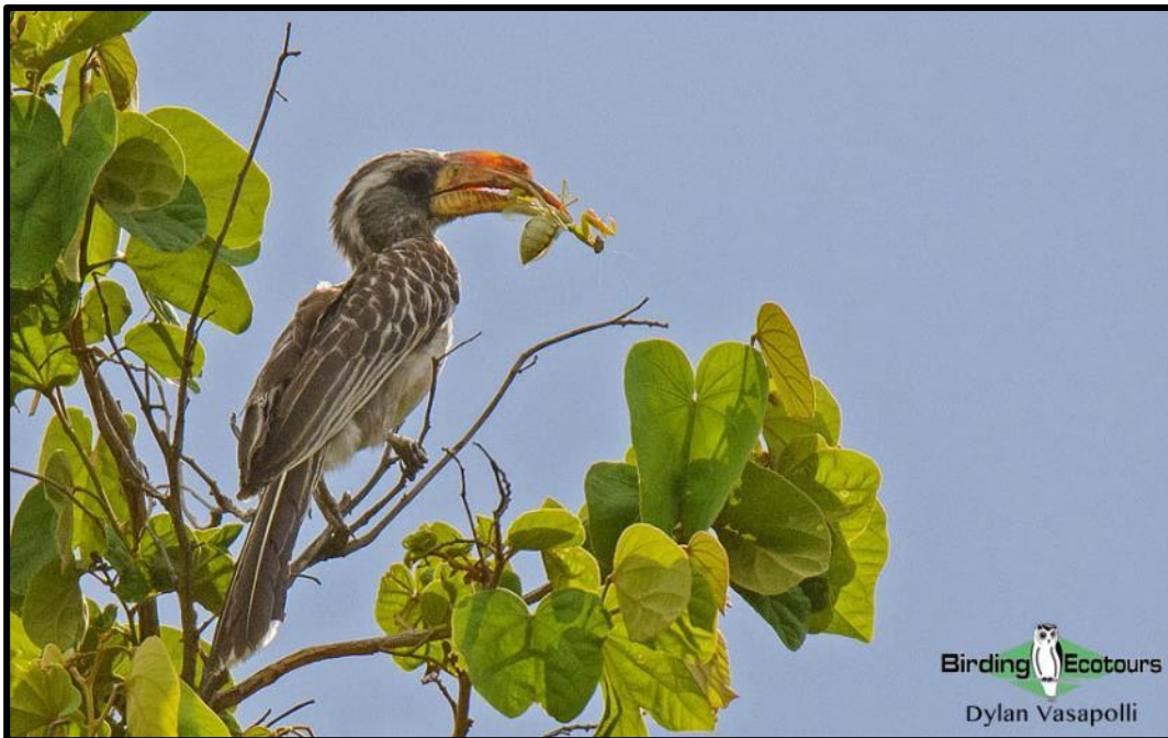
Pale-billed Hornbill is one of several miombo specials we may see today.

Our main target this morning will be the endemic Chaplin's Barbet , and we have several reliable stakeouts for this species close to our accommodation. We will spend time searching the woodlands, particularly around sycamore figs, the species' primary food source. In addition to the barbet, we will have opportunities to connect with many of the previously mentioned species, along with others such as Croaking Cisticola , Striped Kingfisher , Greater Blue-eared Starling , Meyer's Parrot , African Golden Oriole , and a variety of other woodland birds. After finding the barbet and enjoying breakfast at the lodge, we will begin the four-hour drive northeast to our accommodation near the town of Mkushi.