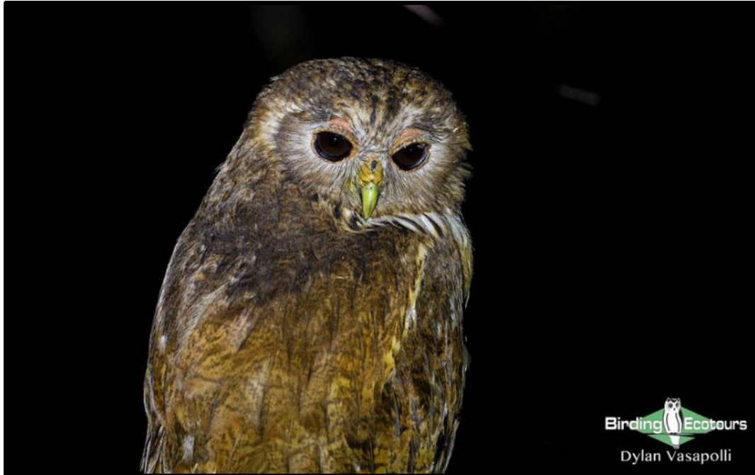
The rare Vermiculated Fishing Owl will certainly be a tour highlight!