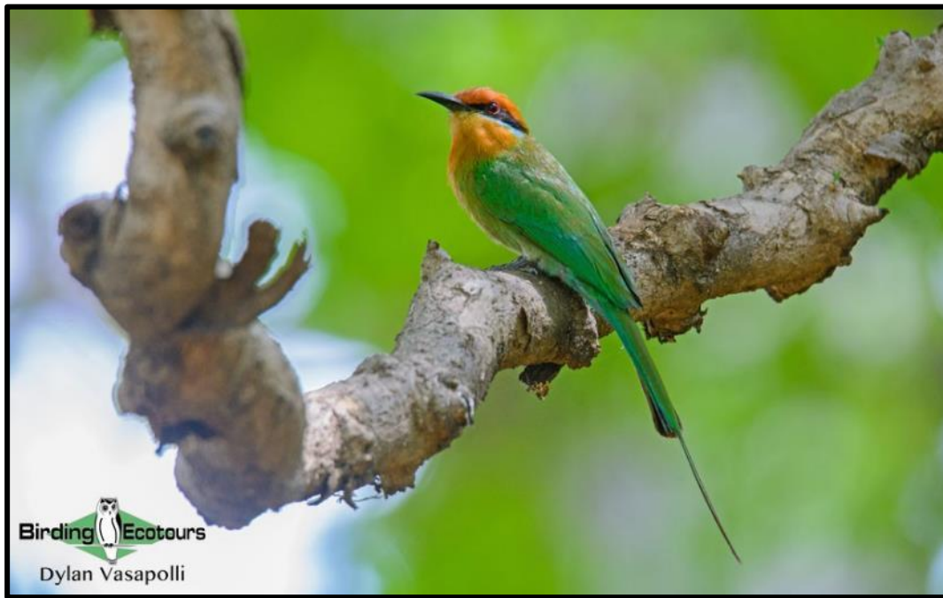
Böhm's Bee-eater is always a special bird to see!