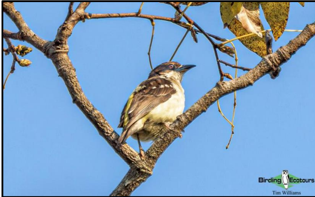
The near-endemic Bar-winged Weaver can be challenging to find.