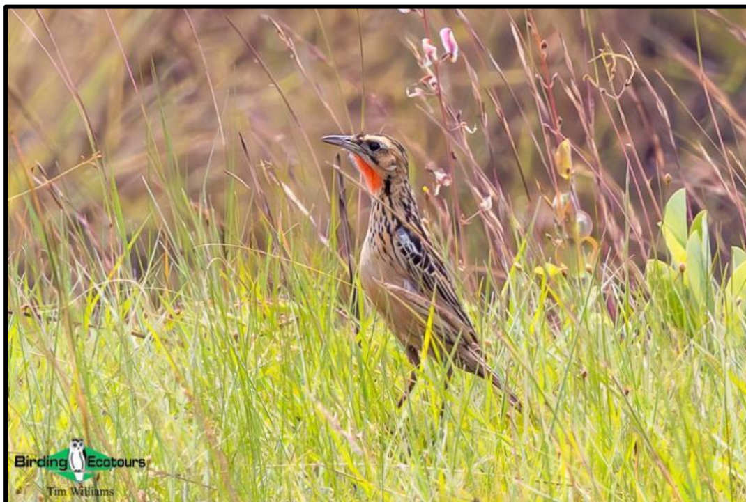
Grimwood's Longclaw is one of the main attractions of northwest Zambia.

Following an early breakfast at our accommodation in Mutanda, we will travel west along the main road, stopping briefly at a breeding colony of Red-throated Cliff Swallows , before branching off onto dirt roads that traverse a varied landscape of forests, woodlands, and seasonally wet dambos. Our first stop will likely be at Mufundu Plain, where we will search for the range-restricted Grimwood's Longclaw , Angola Lark , and Black-and-rufous Swallow . Other new species for us here may include Great Snipe , the attractive Blue-breasted Bee-eater , Stout Cisticola , Sooty Chat , Rosy-throated Longclaw ( Fülleborn's Longclaw also occurs here), and Short-tailed Pipit . Locust Finch can be common here, and we will certainly try for good views of this much-wanted bird.