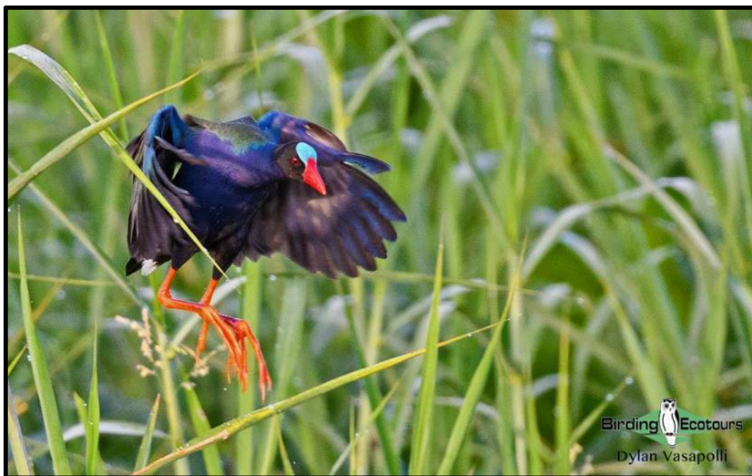
Allen's Gallinule is a stunning bird that we could see on our first afternoon.

After we arrive in Lusaka, Zambia's capital and largest city, we will begin the two-hour drive north through villages and degraded woodlands before reaching the Chisamba area. We will check into our comfortable lodge and aim to head out for our first birding session in the afternoon. A nearby wetland should yield many widespread species, including Marabou Stork , Knob-billed , and White-faced Whistling Ducks , African Wattled Lapwing , African Fish Eagle , and African Jacana . Some of the scarcer waterbirds that we have a chance of seeing here include Rufous-bellied Heron , Allen's Gallinule , African Rail , and Greater Painted Snipe .