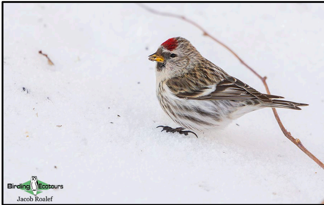
Redpoll was a treat to see.

A bittersweet moment for sure, but something to leave on the table for next time. We headed back to Duluth for our final dinner and to celebrate this great trip.