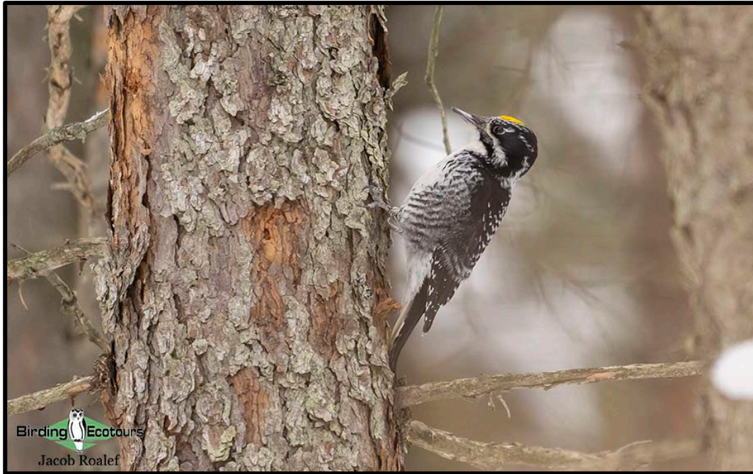
The elusive American Three-toed Woodpecker was accommodating on this trip.

breasted Nuthatches. For our final hour of the day, we spent time searching for owls again but only came up with a North American Porcupine munching through some thick trees. A local pulled up and gave us some intel on an owl she often sees and, while this didn't yield any fruit, we did have fun trying! Back to Duluth for dinner and a rest after a long day birding.