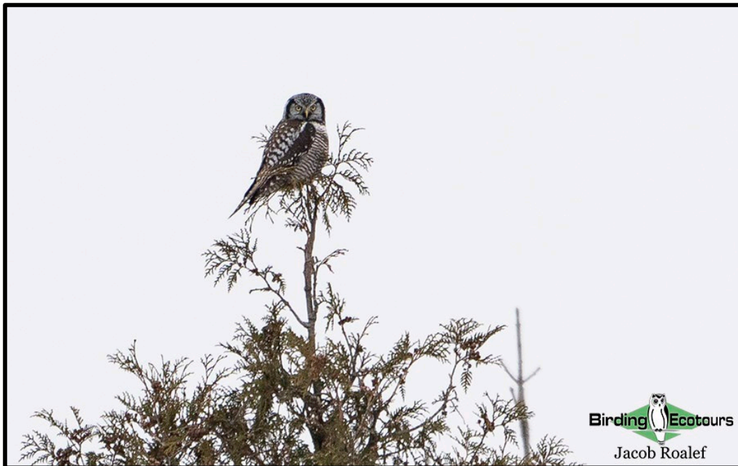
We had to work hard before finally scoring views of Northern Hawk Owl .

This week was quite balmy compared with the first tour, but even then, conditions were still below freezing for the duration of the trip. This made for some beautiful birding days in this winter wonderland. Overall, the irruption was slow this year for many species, however, this tour still managed a fantastic bird list and some incredible encounters with many winter special species. Avian highlights included Long-eared , Short-eared , and Snowy Owls , Eastern Screech-Owl , Northern Hawk Owl , Barrow's Goldeneye , Harlequin Duck , Evening and Pine Grosbeaks , Redpoll , Canada Jay , Ruffed and Sharp-tailed Grouse , Bohemian Waxwing , Black-backed and American Three-toed Woodpeckers , Trumpeter Swan , American Tree Sparrow , and Great Grey (Northern) Shrike . A total of 62 bird species were seen, along with a few mammals, including Red Squirrel , North American Porcupine , and White-tailed Deer . Full mammal and bird lists can be found at the end of the report.