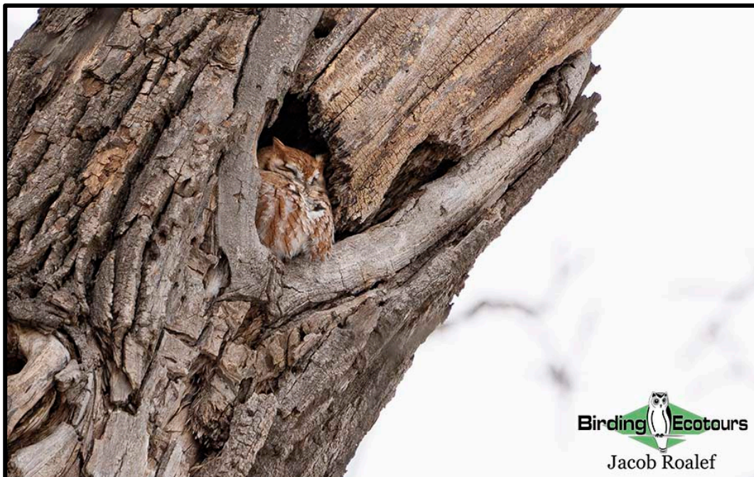
This adorable, red morph Eastern Screech-Owl was snoozing away in its hole.

Our small group all arrived by lunchtime, so we enjoyed a bit of lunch and introductions before heading out for our first taste of birding in Minnesota together. We started off strong with a visit to the dog park near the Minneapolis airport and scored some great views of a roosting Long-eared Owl . Hard to beat an owl as one of the first species of the trip, but we decided to try for a second one, so we headed off to Roberts Bird Sanctuary. We had a lovely walk and managed to find a sleepy red morph Eastern Screech-Owl facing out of its hole. What a start, two great owl species! Now it was time for a few more common species. We headed off to Minnesota Valley NWR and Fort Snelling State Park, where we added Trumpeter Swan, Bald Eagle, Red-bellied Woodpecker, Northern Flicker, Dark-eyed Junco, House Finch, Northern Cardinal and more to our trip list. We wrapped up the day with some cold, unsuccessful searching at the Minneapolis airport, but all things considered, we had a fantastic first half day of birding and the trip was off to a hot start that we hoped to continue! Time to celebrate our first owls with some delicious Midwest food.