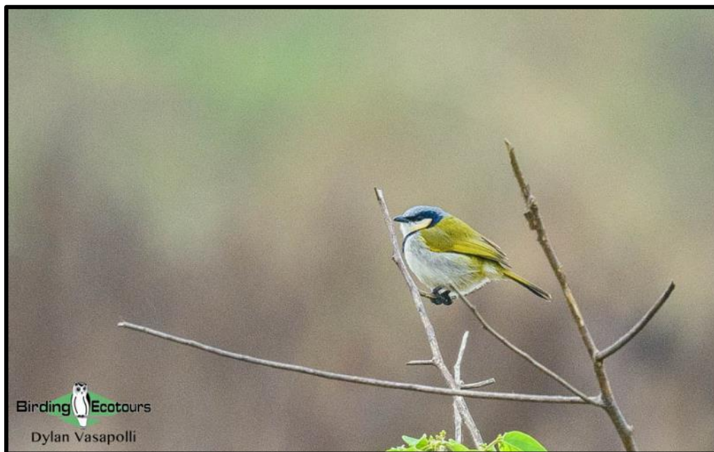
The odd-looking Black-collared Bulbul is uncommon throughout its relatively small range.

Most of our targets will be sought in the forests and dense thickets, for example, Western Bronzed-naped Pigeon , White-spotted Flufftail , Narina Trogon , Blue Malkoha , Olive Long-tailed Cuckoo , Purple-throated Cuckooshrike , Blue-breasted Kingfisher , Least and Pallid Honeyguides , the rare and extremely shy Spotted Thrush-Babbler (easy to hear, challenging to see), Fraser's Rufous Thrush , Grey-winged Robin-Chat , Honeyguide Greenbul , and Splendid Starling . Forest streams in this area always require careful scanning for Shining-blue Kingfisher and the scarce White-bellied Kingfisher . Spot-breasted Ibis can, with luck, also be seen in this area, particularly at dusk when vocal birds return to roost. In addition to all these new species, Nyachisala also serves as a backup for some of our targets, like Bamboo Warbler and Laura's Woodland Warbler , should we have missed them earlier in the trip.