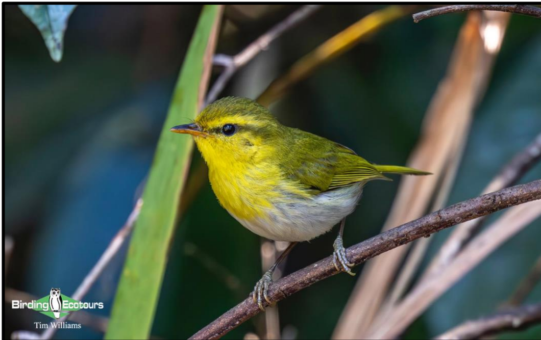
Laura's Woodland Warbler is one of many range-restricted targets at Mutinondo Wilderness.

Because these days will follow a similar pattern, they are discussed together here. We will have two full days to explore Mutinondo in search of its many excellent birds, some of which have already been mentioned under Day 2 at Mkushi. The striking Ross's and Schalow's Turacos are delightfully common here, where they inhabit lush woodlands along with a variety of other sought-after birds like the stunning Anchieta's and Western Miombo Sunbirds , Black-backed Barbet , Brown-necked Parrot , Grey-olive Greenbul , Souza's Shrike , Miombo Rock Thrush , White-tailed Blue Flycatcher , Miombo Tit , Yellow-bellied Hyliota , Brown-headed Apalis , Evergreen Forest Warbler , Wood Pipit , Reichard's Seedeater , and Cabanis's Bunting , to name a few.