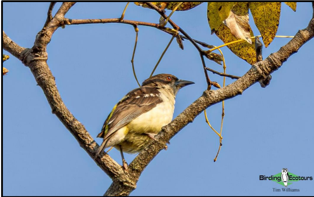
The near-endemic Bar-winged Weaver can be challenging to find.